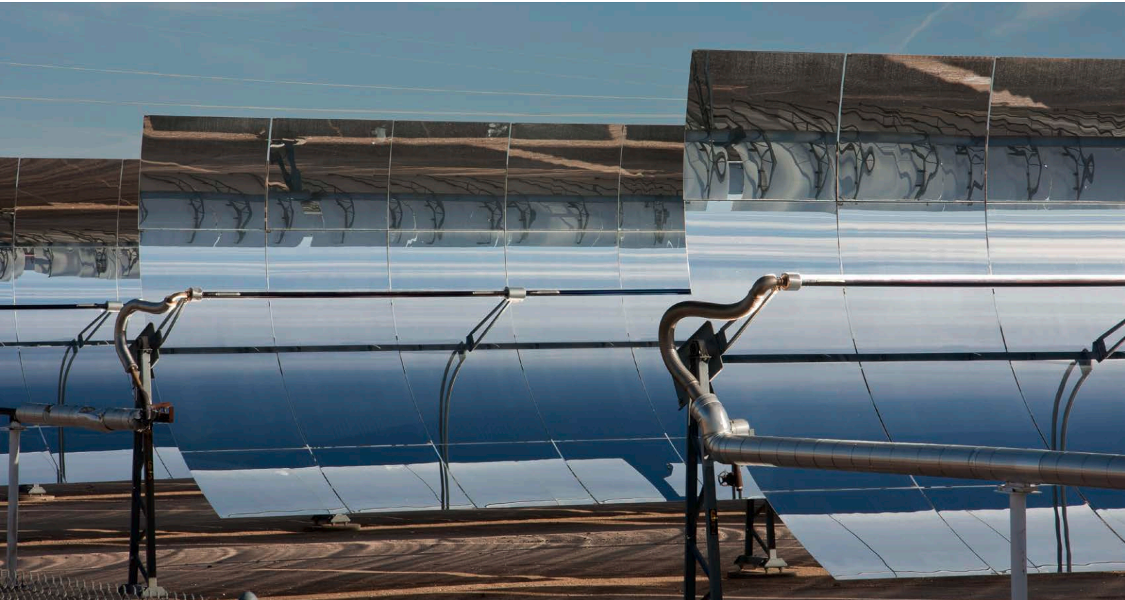
The CSP plant Noor II is located in Morocco and uses 62,500 stainless steel tubes.